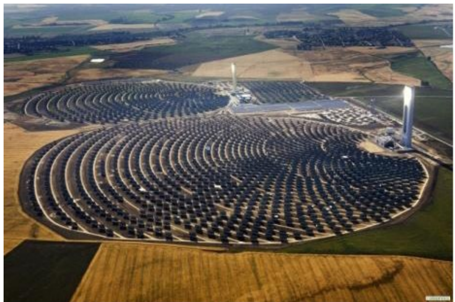
A solar thermal power plant operating in Spain since 2005.

These funds should be supplemented by the winding back of subsidies to polluting industries, particularly diesel fuel rebates currently being paid to mining companies experiencing windfall trading conditions 2 .